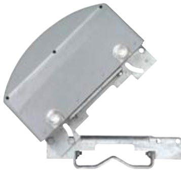
DB5084-AZ Variable Azimuth Wall Mounting Kit