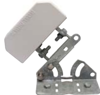
● DB5094-AZ Variable Azimuth Wall Mounting Kit